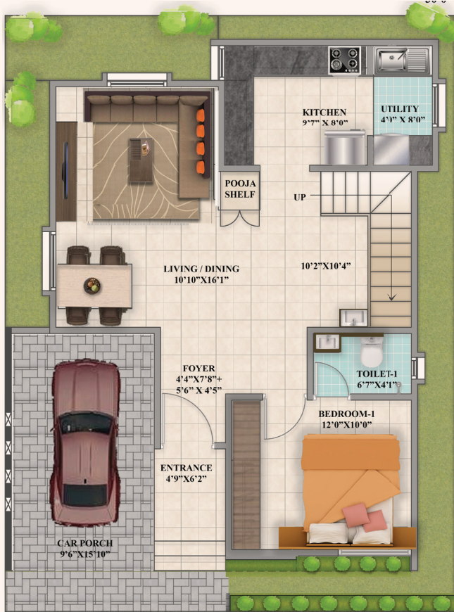
PLOT AREA: 1200 SQ FT (30X40)