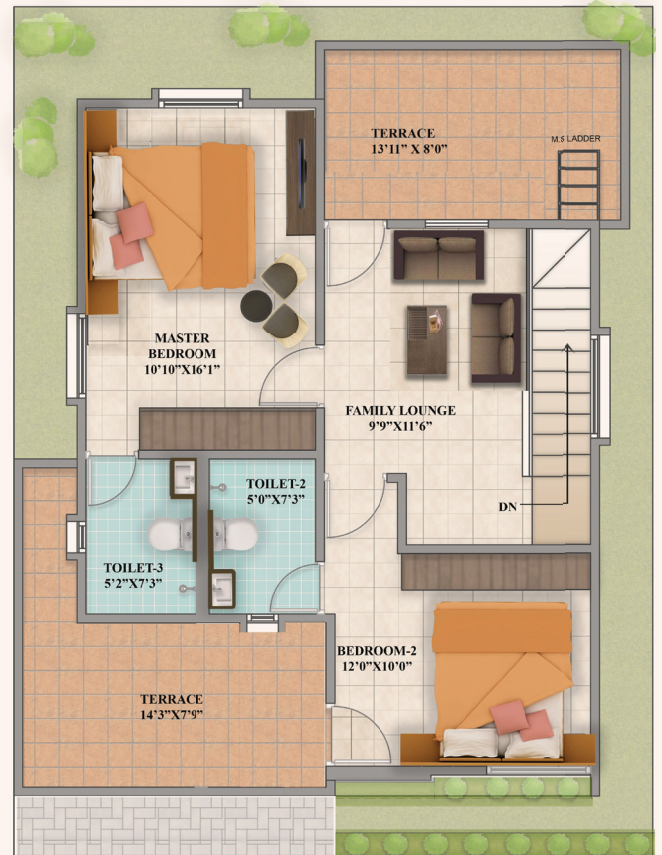
SUPER BUILD UP AREA: 1648 SQ FT