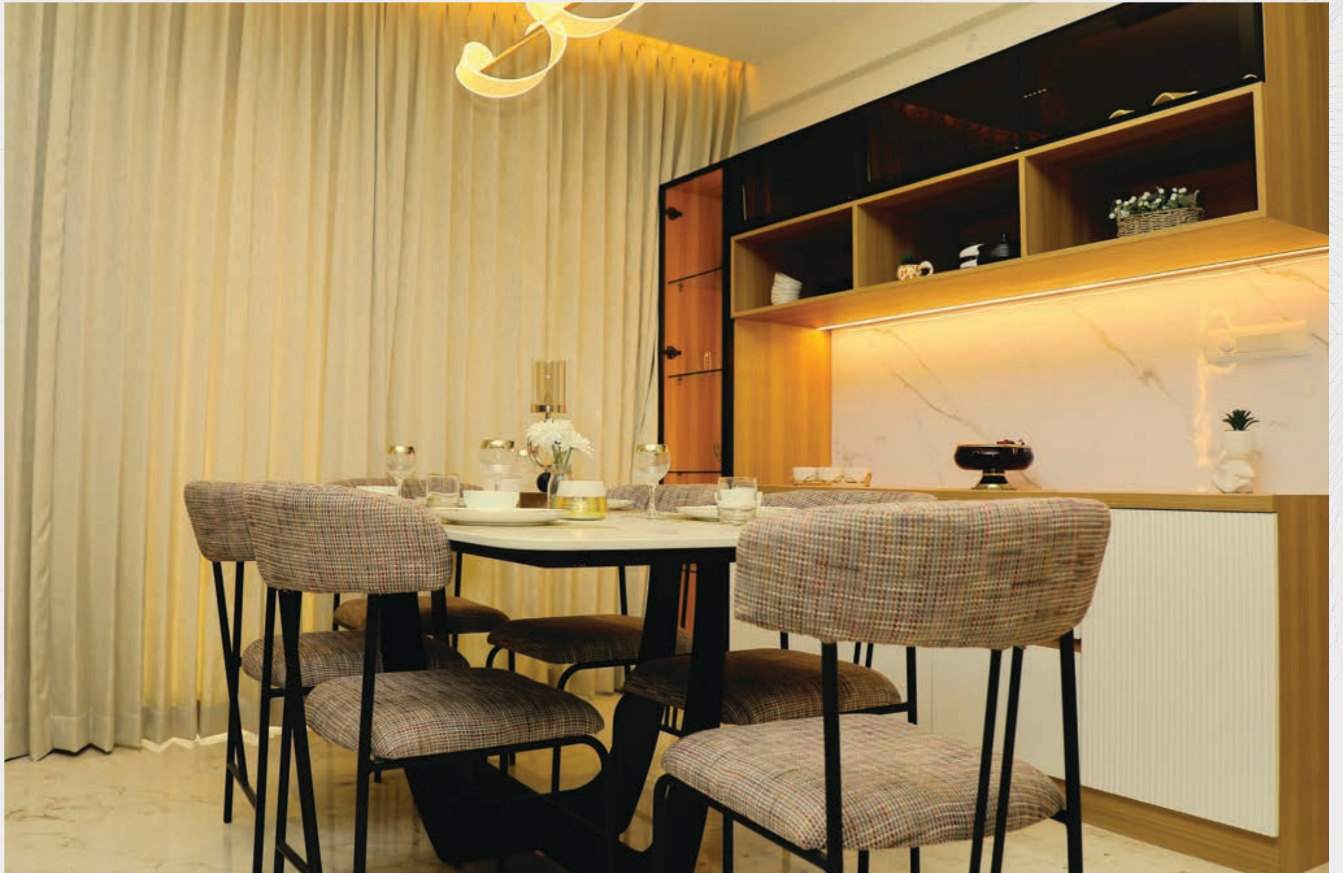
Actual images of the exquisite living room envisioned by Oceanus White Meadows