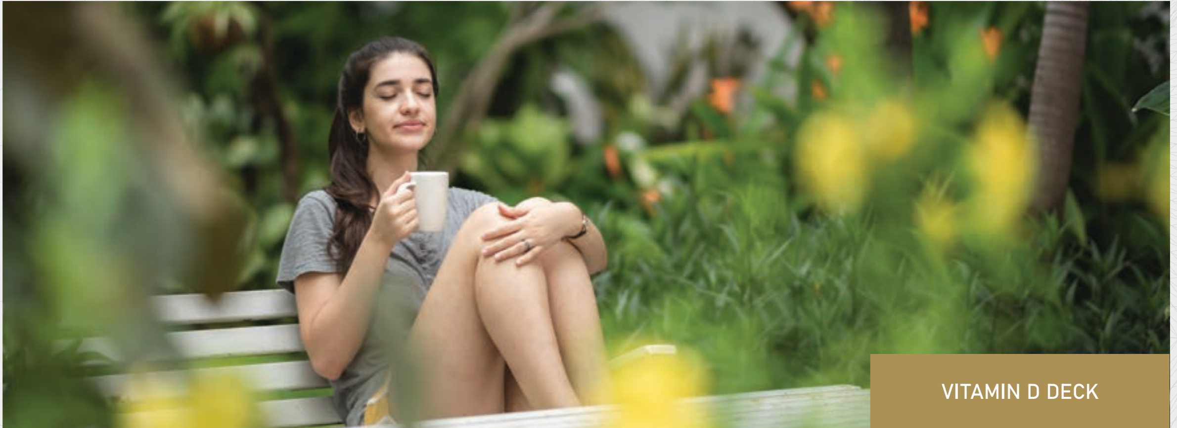
VITAMIN D DECK