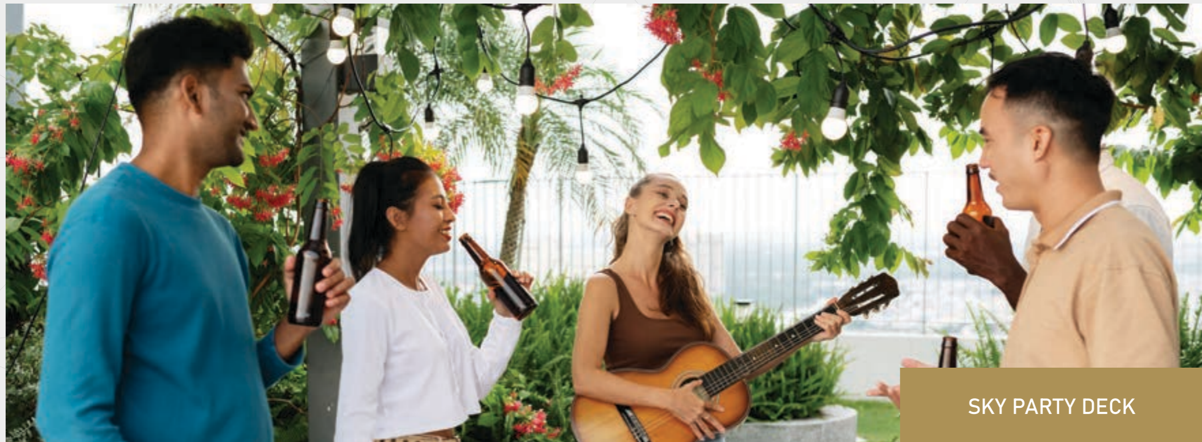
SKY PARTY DECK