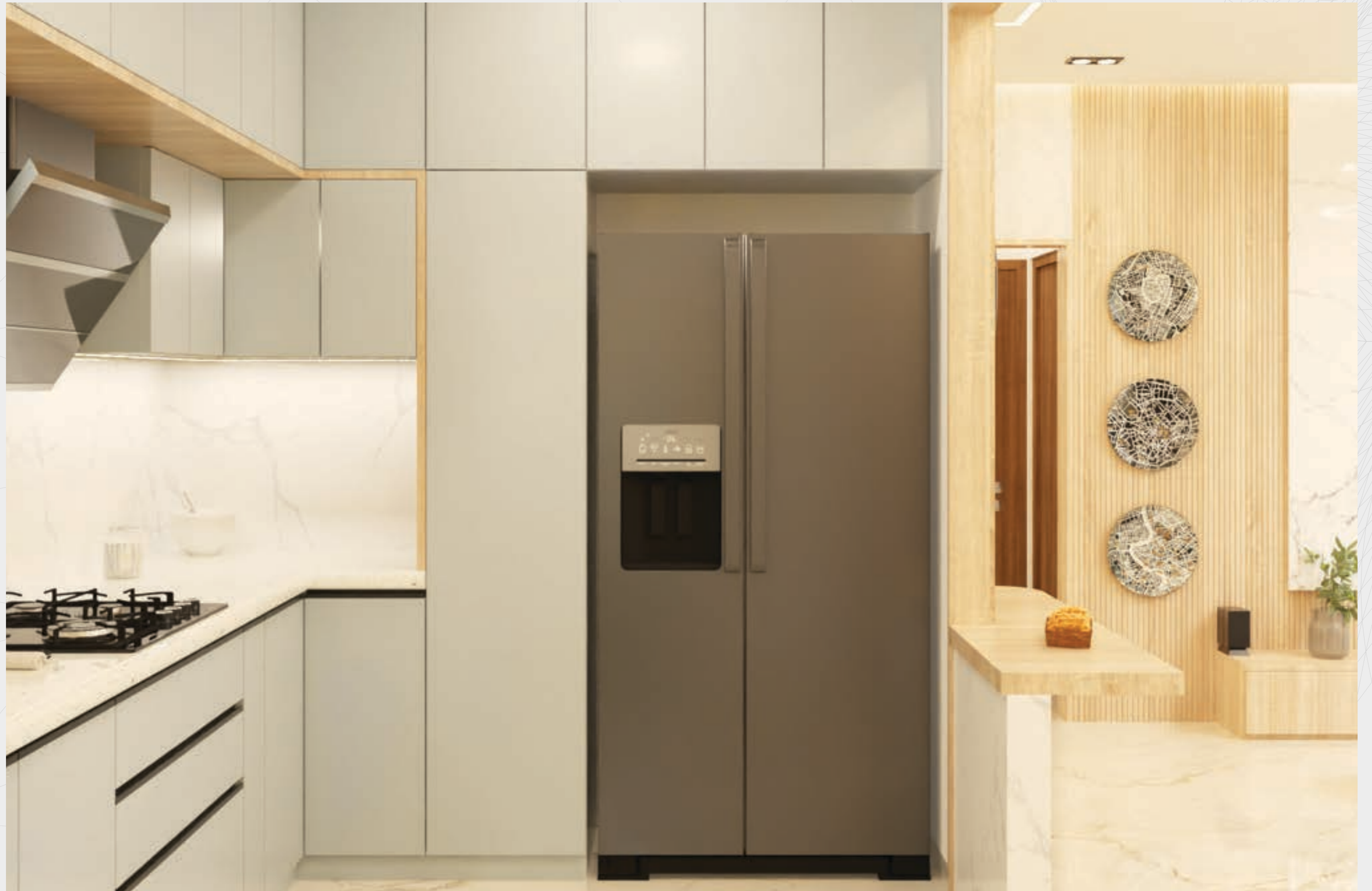
Artist's rendition of visionary kitchen space by Oceanus White Meadows