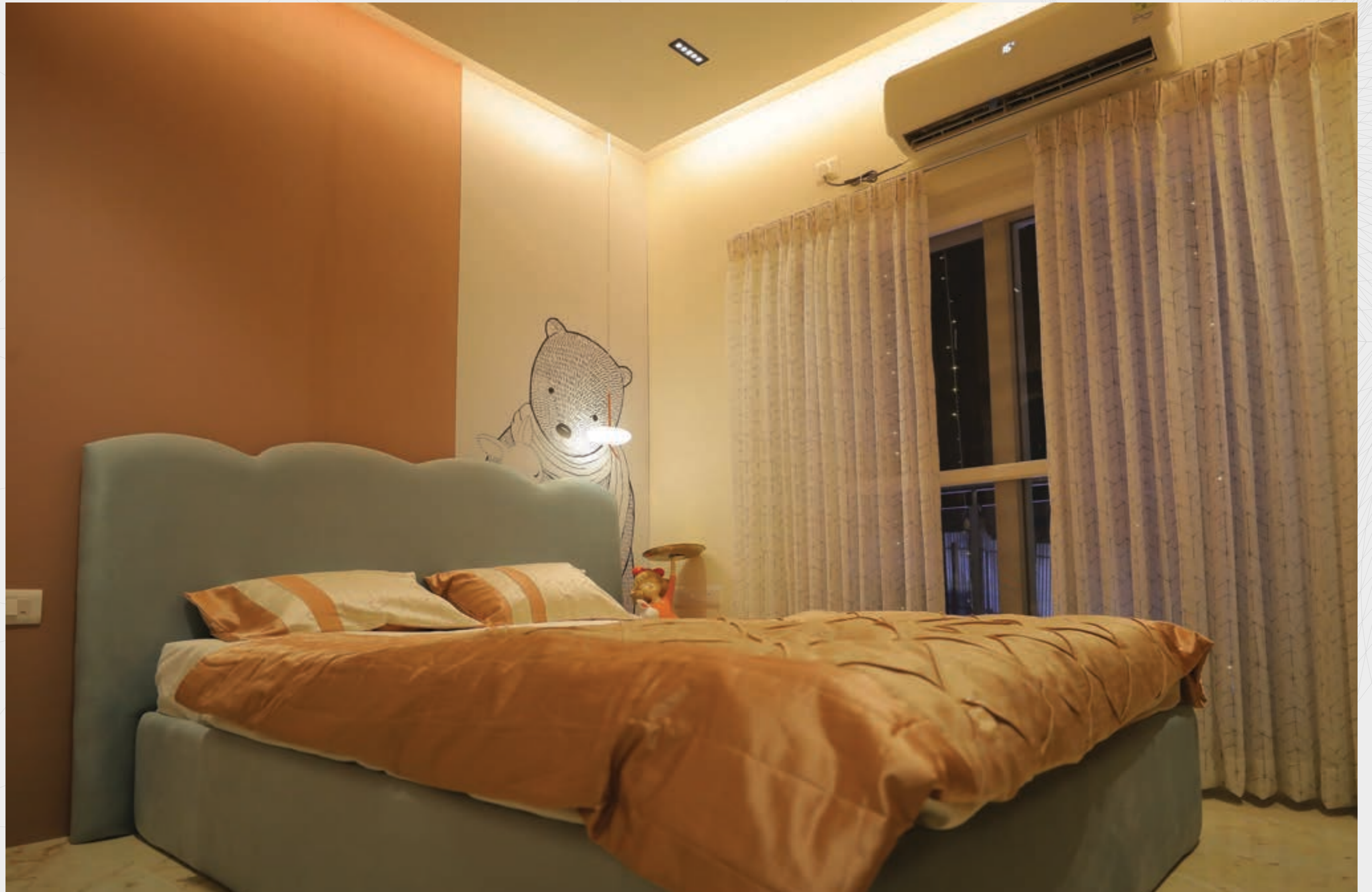
Actual image of the tranquil and lavish bedroom crafted by Oceanus White Meadows